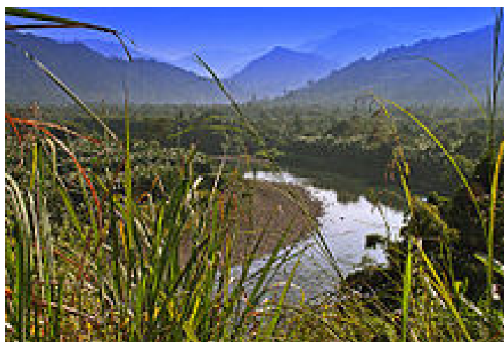
42% of Nagaland is covered by forests. Forest and agriculture are primary drivers of its economy.

The Gross State Domestic Product (GSDP) of Nagaland was about ₹12065 crore (US$2.0 billion) in 2011-12. Nagaland's GSDP grew at 9.9% compounded annually for a decade, thus more than doubling the per capita income.