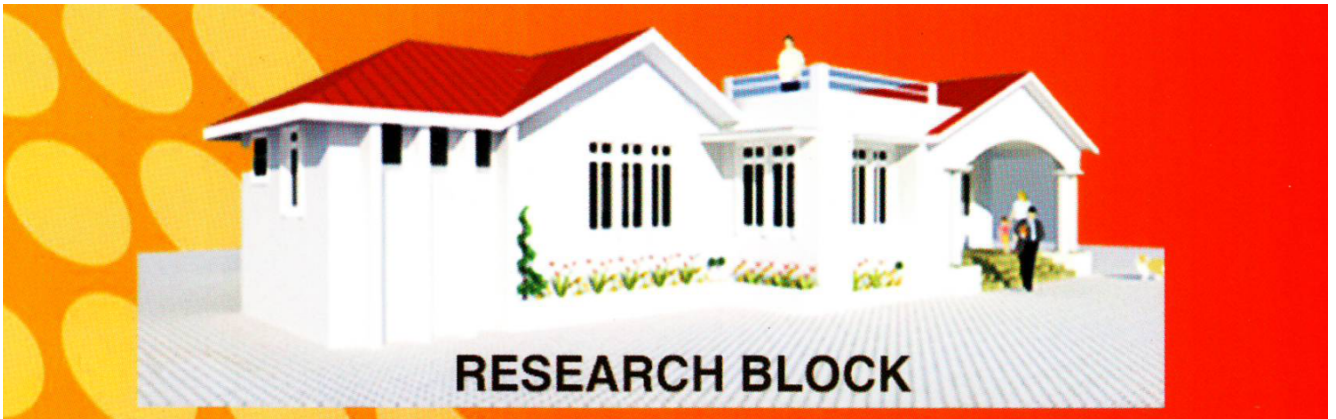
A perspective view of the Research Block.