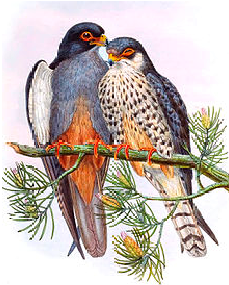
About a million Amur Falcon, Falco peregrinus, roost in Nagaland. That is about 50 falcons per square kilometer.

Nagaland is rich in flora and fauna. About one-sixth of Nagaland is under the cover of tropical and sub-tropical evergreen forests—including palms, bamboo, rattan as well as timber and mahogany forests. While some forest areas have been cleared for jhum cultivation, many scrub forests, high grass, reeds; secondary dogs, pangolins, porcupines, elephants, leopards, bears, many species of monkeys, sambar, harts, oxen, and buffaloes thrive across the State's forests. The Great Indian Hornbill is one of the most famous birds found in the State. Blyth's Tragopan, a vulnerable species of pheasant, is the State Bird of Nagaland. It is sighted in Mount Japfü and Dzükou Valley of Kohima district, Satoi range in Zunheboto district and Pfütsero in Phek district. Of the mere 2500 tragopans sighted in the world, Dzükou valley is the natural habitat of more than 1,000.