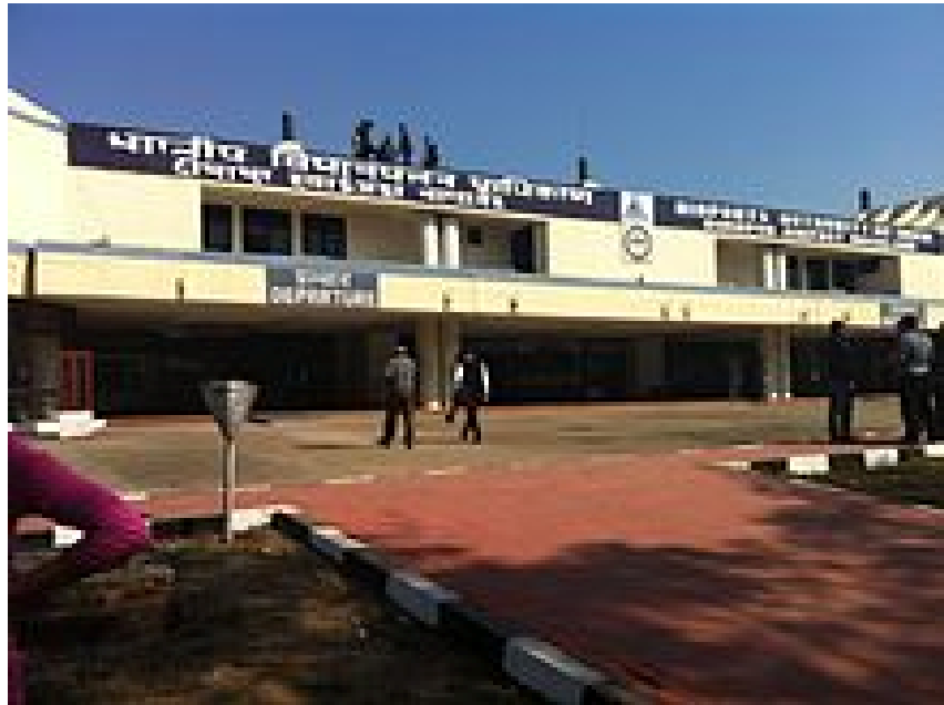
Dimapur Airport Departures