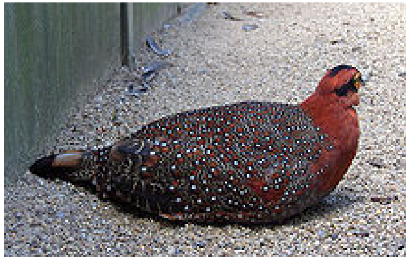
Blyth's Tragopan or the Grey-bellied Tragopan

Nagaland has a largely monsoon climate with high humidity levels. Annual rainfall averages around 70–100 inches (1,800–2,500 mm), concentrated in the months of May to September. Temperatures range from 70 °F (21 °C) to 104 °F (40 °C). In winter, temperatures do not generally drop below 39 °F (4 °C), but frost is common at high elevations. The State enjoys a salubrious climate. Summer is the shortest season in the State that lasts for only a few months. The temperature during the summer season remains between 16 °C (61 °F) to 31 °C (88 °F). Winter makes an early arrival and bitter cold and dry weather strikes certain regions of the State. The maximum average temperature recorded in the winter season is 24 °C (75 °F). Strong north-west winds blow across the State during the months of February and March.