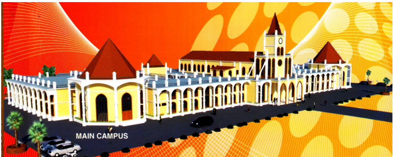
A perspective view of the Main Block.

The main campus of The Global Open University Nagaland has been developed at 6 th / 7 th Mile on the National Highway No. 39 at Sodzulhou Village, Dimapur under the supervision of the Public Works Department (PWD) of the Government of Nagaland. The campus includes the Administrative Block, Hotel Management Block, Library, International Guest House, Hostels, Staff Quarters etc.