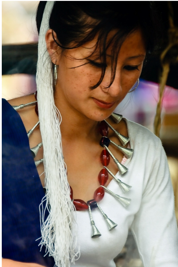
A Naga woman dressed for her festival.

Nagaland is known in India as the land of festivals. The diversity of people and tribes, each with their own culture and heritage, creates a year long atmosphere of celebrations. In addition, the State celebrates all the Christian festivities. Traditional tribe-related festivals revolve round agriculture, as a vast majority of the population of Nagaland is directly dependent on agriculture. Some of the significant festivals for each major tribe are: