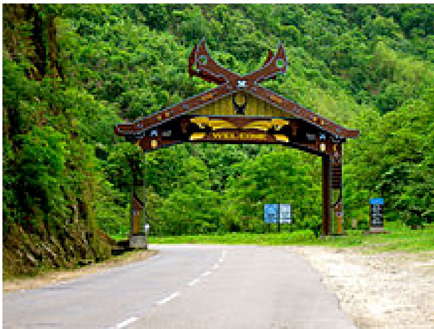
Highway into Nagaland

State highways: 680.1 miles (1,094.5 km)