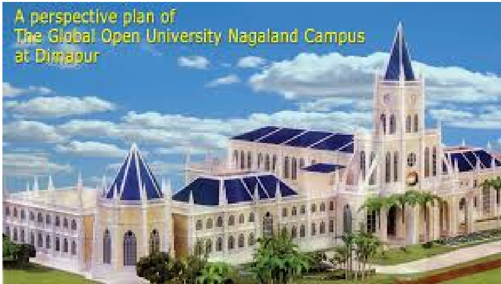
A Perspective Plan of The Global Open University Nagaland Campus at National Highway, Dimapur.