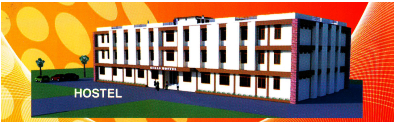
A perspective view of the Hostel.