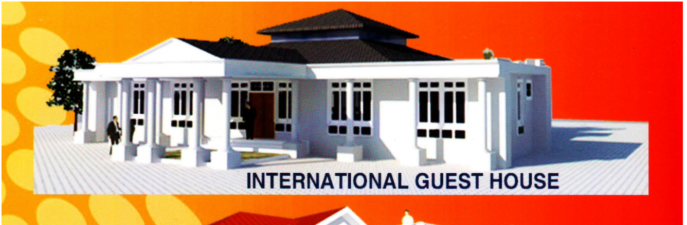
A perspective view of the International Guest House.