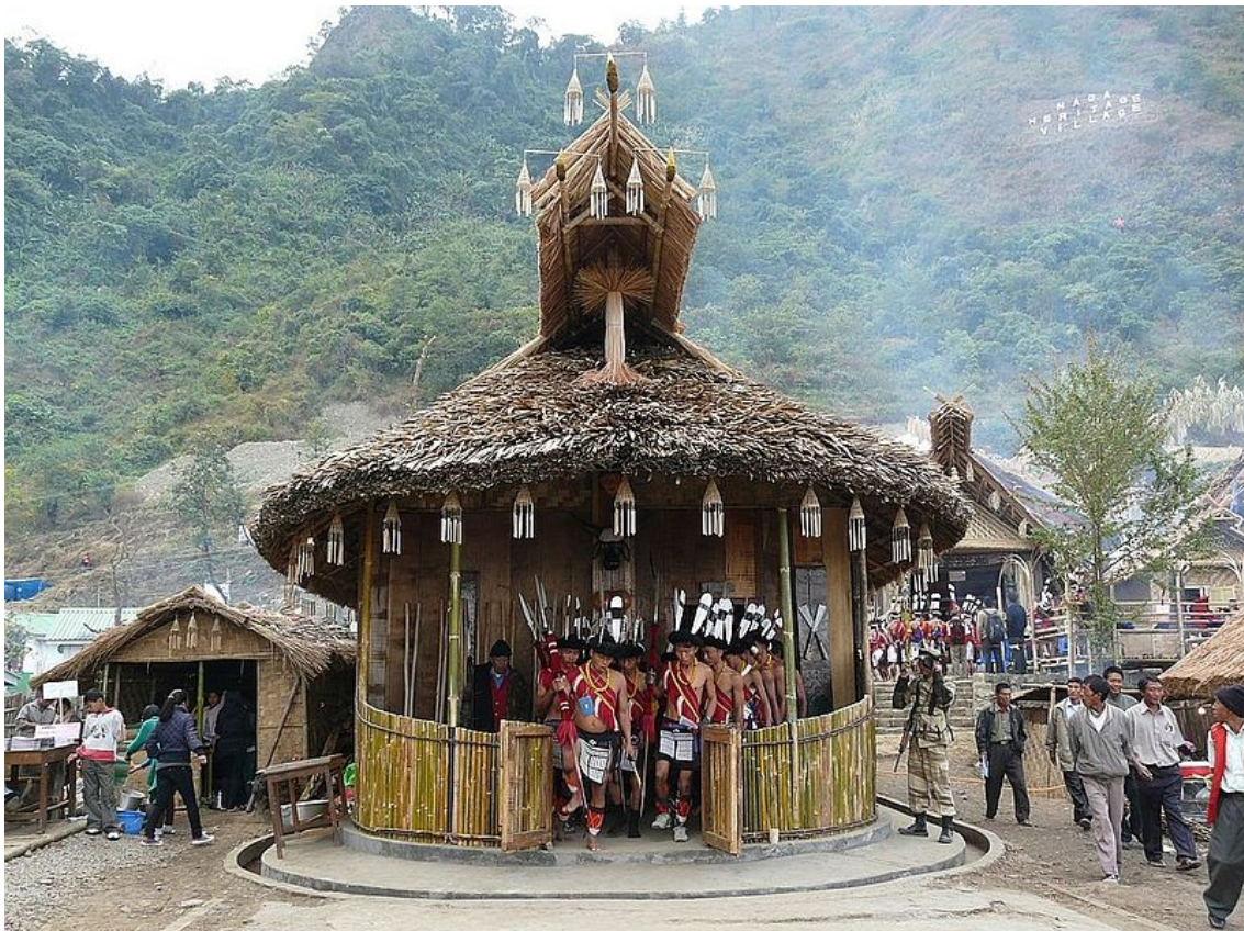
Nagaland Hornbill Festival in progress at the Naga Heritage Village.