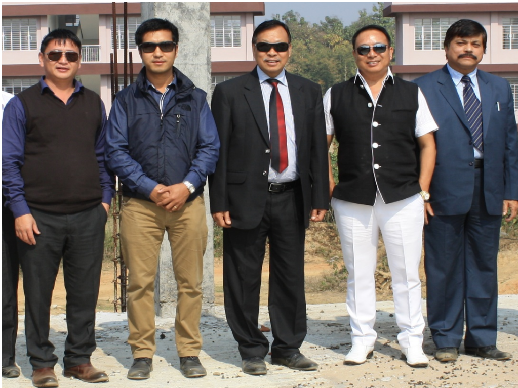
Hon'ble Minister for PWD (Roads and Bridges) and Parliamentary Affairs Government of Nagaland Mr. Kuzholuzo Nienu (Azo) and Hon'ble Parliamentary Secretary, Higher Education and SCERT, Government of Nagaland Mr. Deo Nukhu inspecting the New Campus of The Global Open University Nagaland at the National Highway, Dimapur.