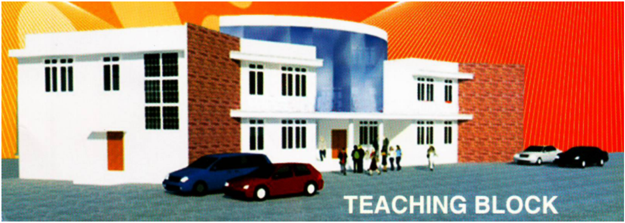
A perspective view of the Teaching Block.