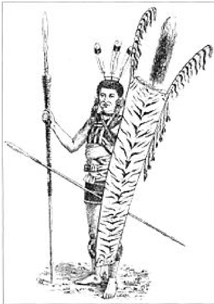
A sketch of Angami Naga tribesman from 1875.