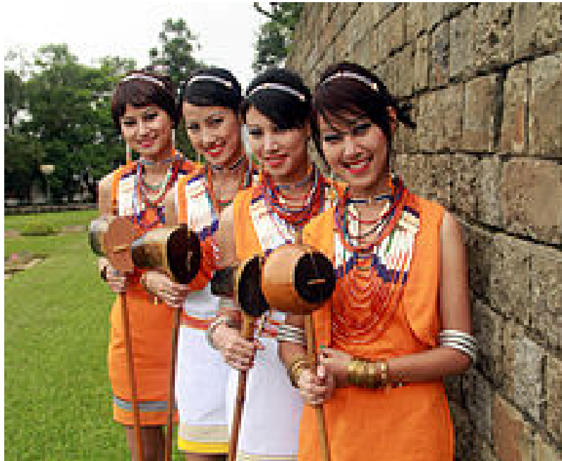
The smiles of Nagaland people

The ancient history of the Nagas is unclear. Ancient Sanskrit scriptures mention Kiratas , or golden skinned people, with distinct culture, who live in the mountains of east after migrating from distant lands. Some anthropologists suggest Nagas belong to the Mongoloid race, and different tribes migrated at different times, each settling in the north-eastern part of present India and establishing their respective sovereign mountain terrains and village-States. There are no records of whether they came from far north Mongolian region, Southeast Asia or Southwest China, except that their origins are from the East of India and that historic records show the present day Naga people settled before the arrival of the Ahoms in 1228 AD.