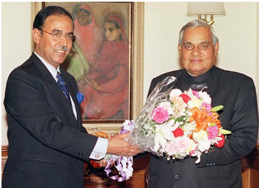
2002 : The Governor of Nagaland H.E. Shri Shyamal Datta presenting a flower bouquet to Prime Minister Hon'ble Shri Atal Bihari Vajpayee.