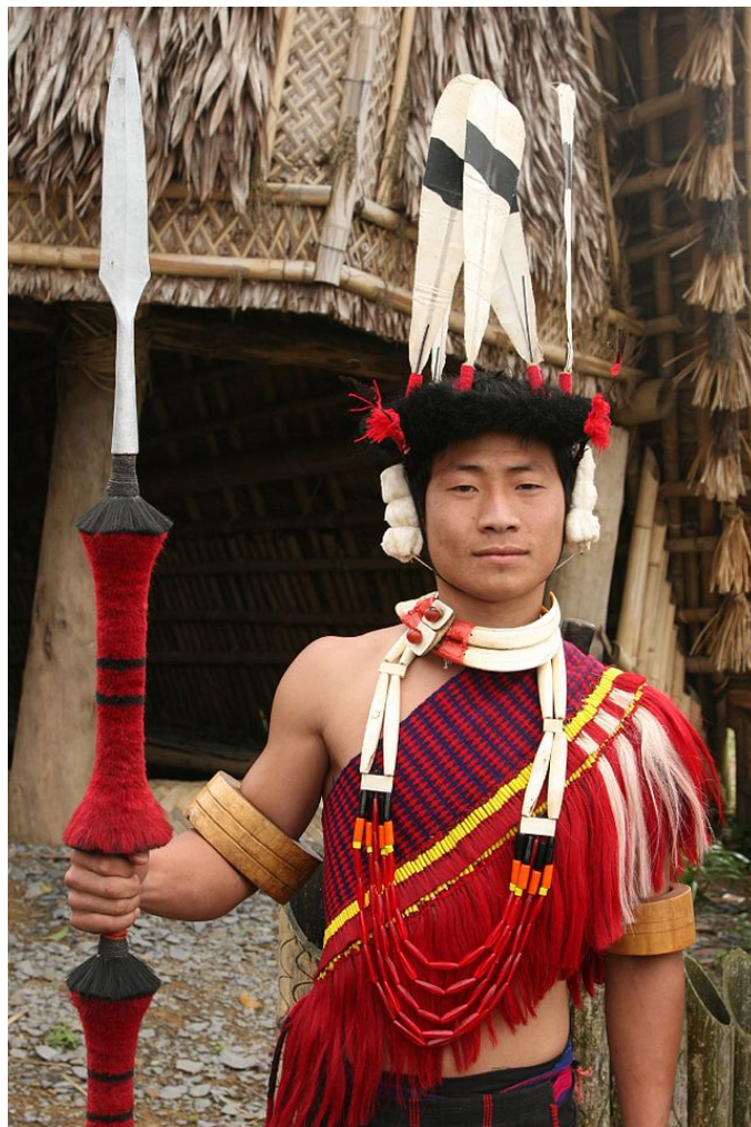
A Naga man dressed for his festival.