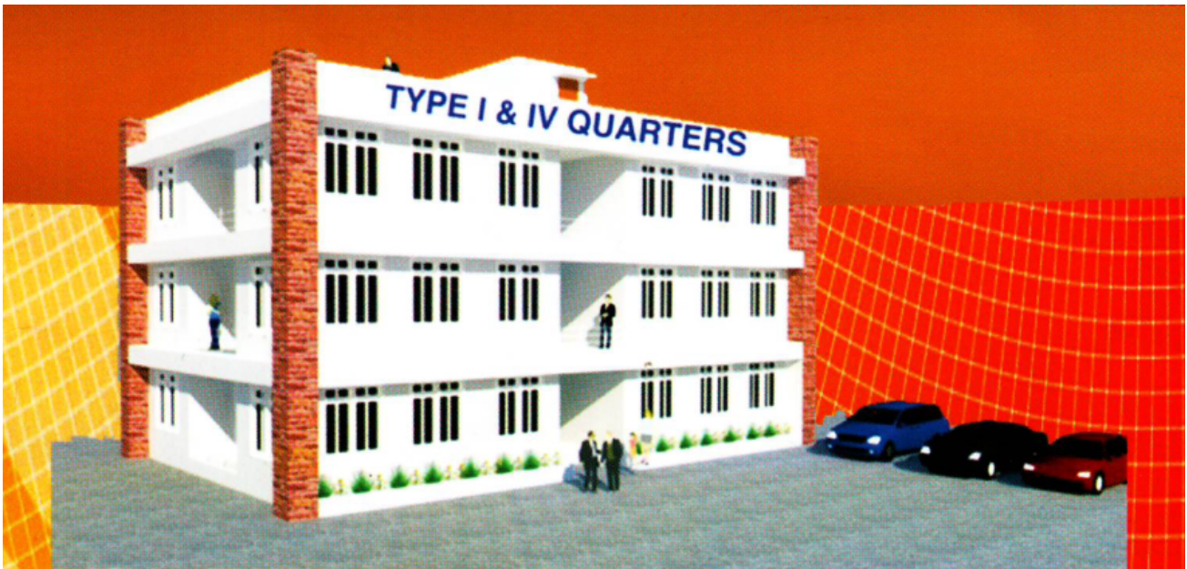
A perspective view of the Type I & IV Quarters for Staff Members.