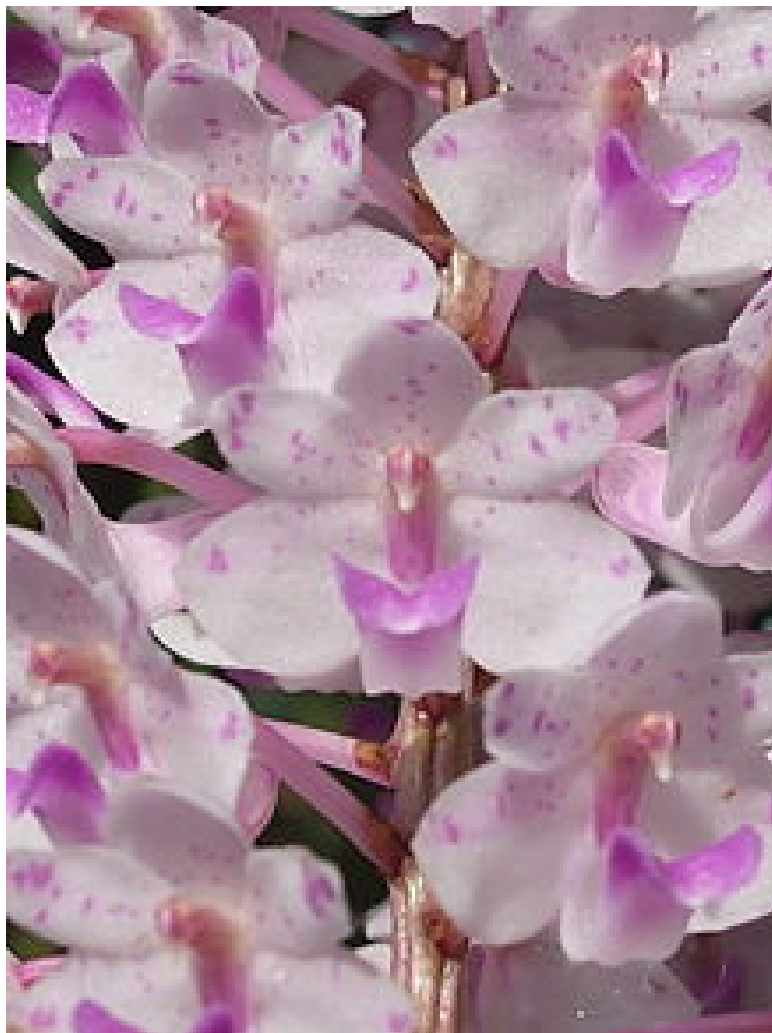
Kopou phool (Rhynchostylis retusa), a type of orchid, in bloom. Nagaland is home to 396 species of orchids, belonging to 92 genera of which 54 having horticultural and medicinal economic importance. Kopou is also used for festive hairstyle decoration by women in India's northeast.

Tourism has a lot of potential, but largely limited due to insurgency and concern of violence over the last five decades. Nagaland's gross State domestic product for 2004 is estimated at $1.4 billion in current prices.