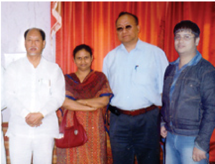
2008 : The Hon'ble Chief Minister of Nagaland Shri Neiphiu Rio and the Chief Secretary Shri Lalhuma with the officials of the University.