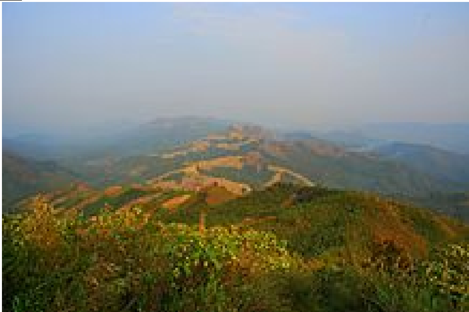
Mountainous terrain of Nagaland

Nagaland is largely a mountainous State. The Naga Hills rise from the Brahmaputra Valley in Assam to about 2,000 feet (610 m) and rise further to the southeast, as high as 6,000 feet (1,800 m). Mount Saramati at an elevation of 12,601.70 feet (3,841.00 m) is the State's highest peak; this is where the Naga Hills merge with the Patkai Range in Burma. Rivers such as the Doyang and Diphu to the north, the Barak river in the southwest and the Chindwin river of Burma in the southeast, dissect the entire State. 20 percent of the total land area of the State is covered with wooded forest, rich in flora and fauna. The evergreen tropical and the sub tropical forests are found in strategic pockets in the State.