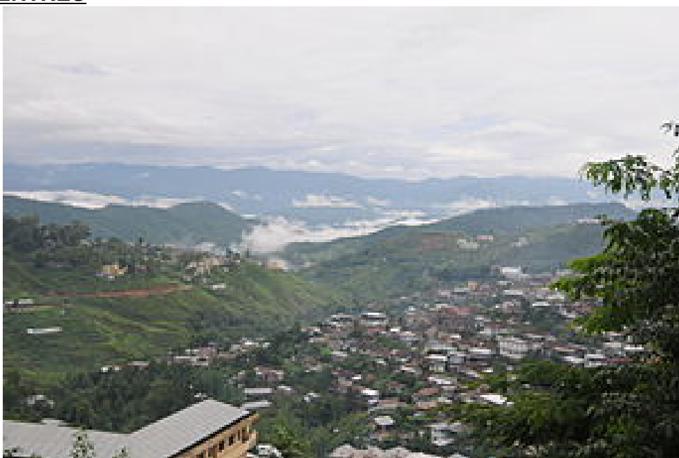
Kohima City, Nagaland

The major urban areas of Nagaland are Dimapur, Kohima, Mokokchung, Tuensang, Wokha, Mon, Zunheboto, Longleng and Kiphire. There are four urban agglomeration areas with population of more than 40,000 in the State: