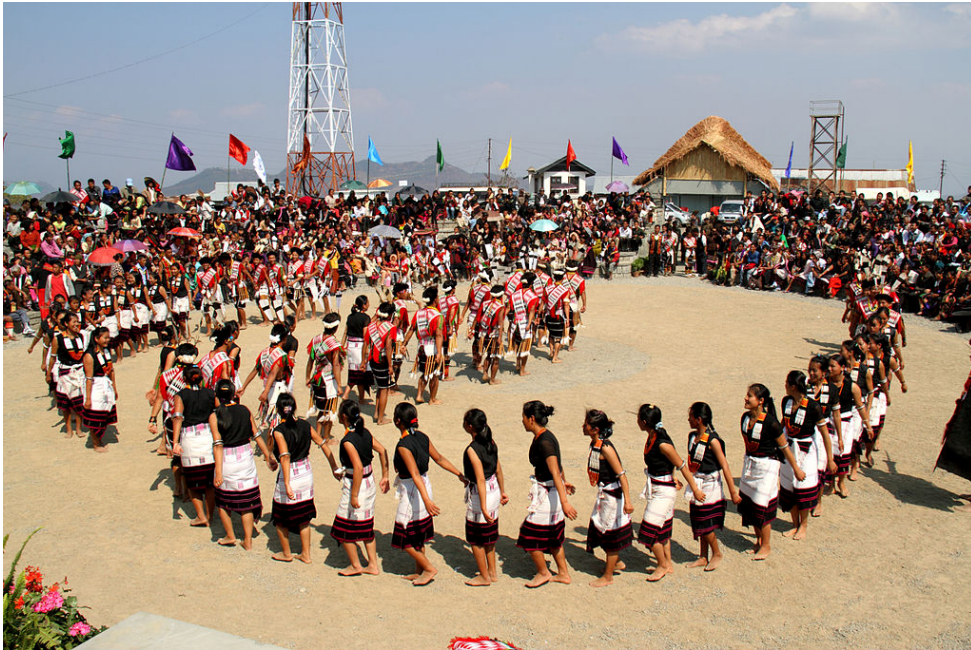
An Angami festival dance in progress.