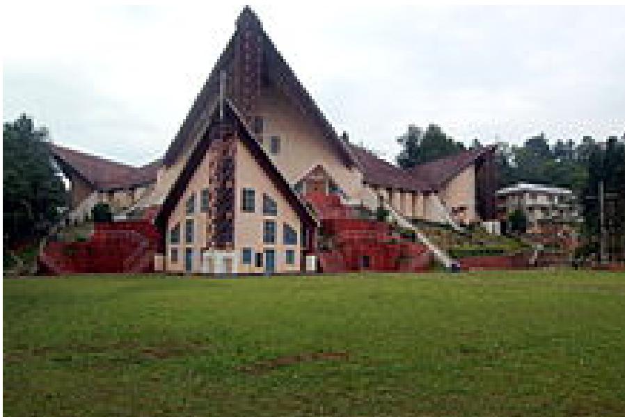
A Cathedral in Kohima City. About 75% of Nagaland people are Baptists.

Christianity is the predominant religion of Nagaland. The State's population is 1.988 million, out of which 90.02% are Christians. The census of 2001 recorded the State's Christian population at 1,790,349, making it, with Meghalaya and Mizoram, one of the three